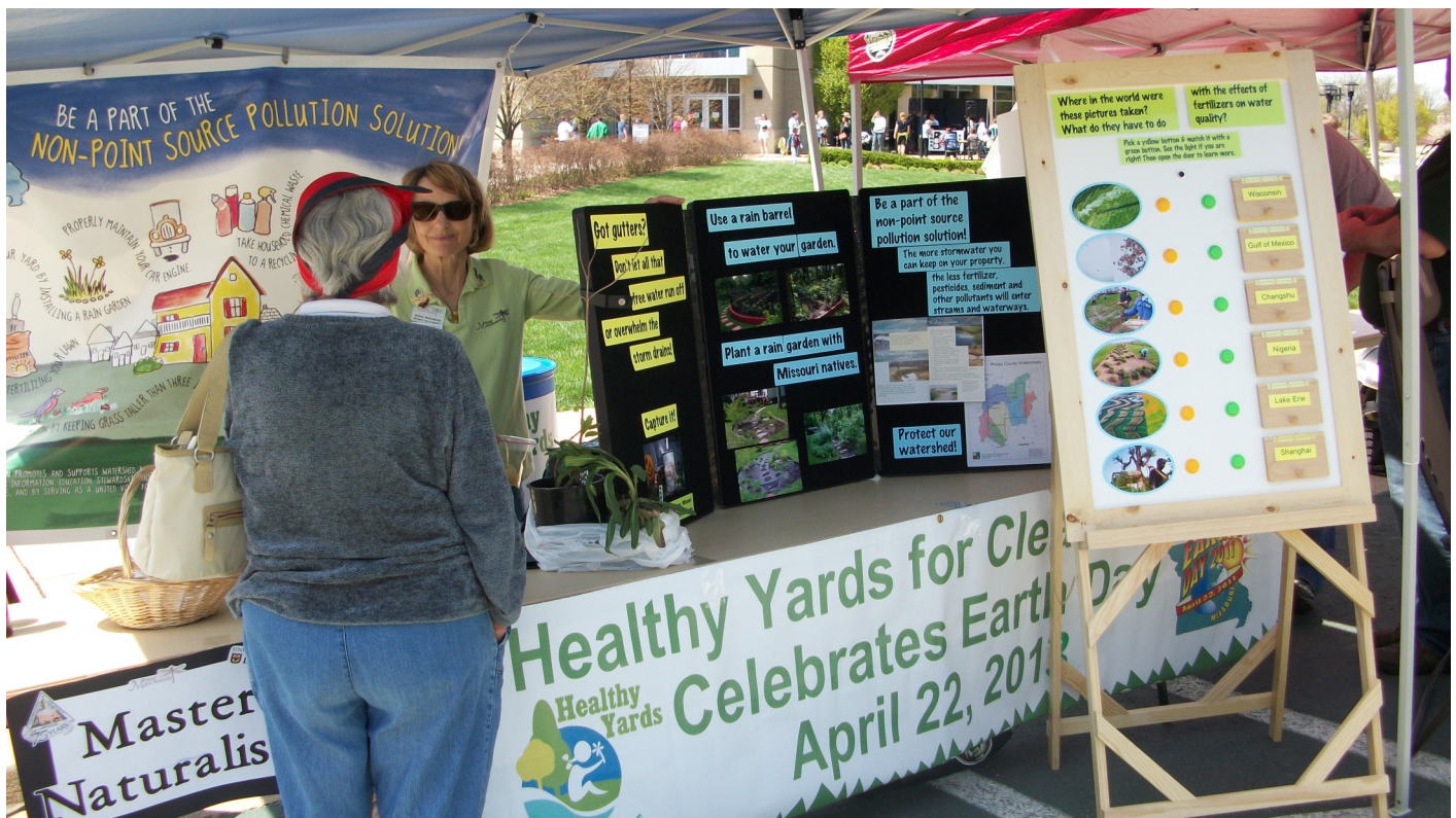
Photo: Big Piney River Stream Team Watershed Association teaches about solutions to non-point source pollution, including best management practices for urban lawns, native plants, and rain barrels.