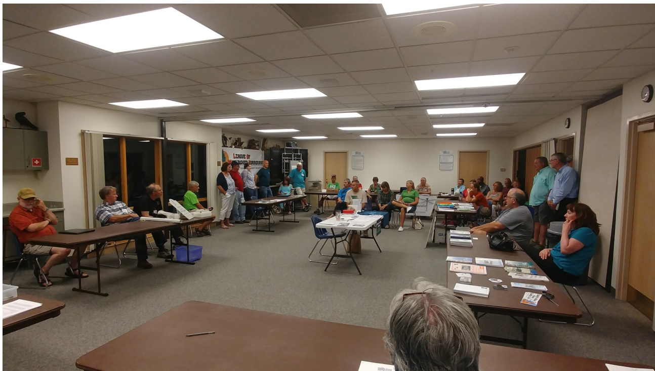
Photo: Stream Teams United brings together Stream Teams and their Associations, forming a Coalition of Missouri citizens that care for Missouri stream resources. As part of this strategic planning process, Stream Teams met in St. Louis to discuss the goals of the Coalition.

Stream Teams United promotes and supports Missouri Stream Teams and Stream Team Associations. We facilitate education of Stream Teams and the general public in order to build an appreciation and knowledge of Missouri stream resources. We support stewardship projects to improve the health of Missouri's rivers and streams. We advocate for clean water, provide information to Missouri citizens, and serve as a united voice for healthy Missouri waters.